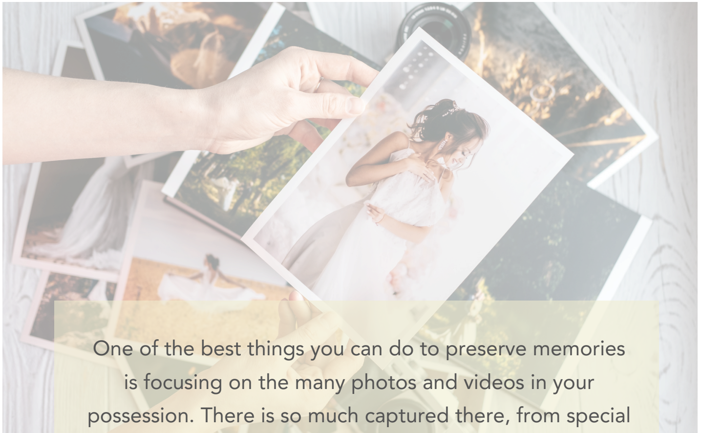
PHOTO ORGANIZING Checklist

One of the best things you can do to preserve memories is focusing on the many photos and videos in your possession. There is so much captured there, from special occasions to important moments and a chronology of your life. In fact you'll find that what you have captured in photo and video form releases you from any need to save most of the 'sentimental' things you have kept that take up so much room in your home.